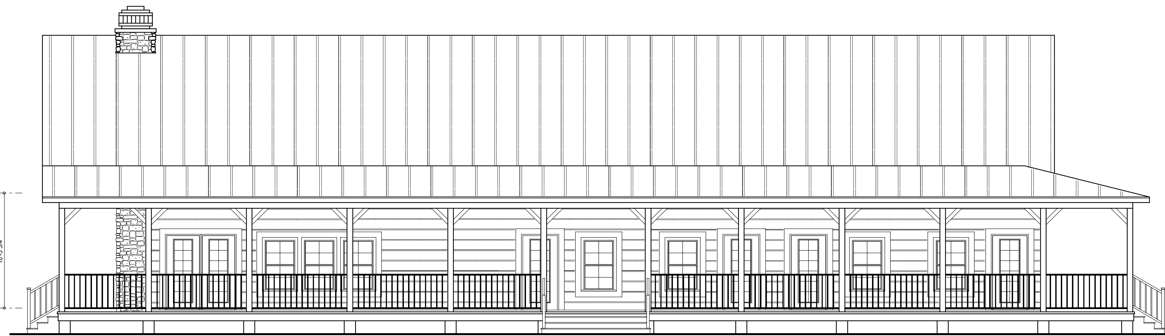
FRONT ELEVATION SCALE: 1/4" = 1'-0"